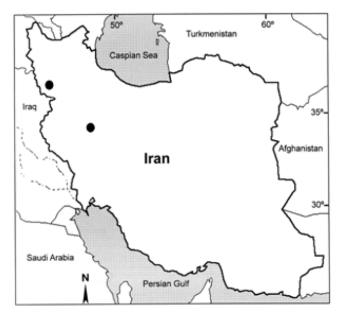
Figure 2. Distribution map of Cerastium pentandrum in Iran.