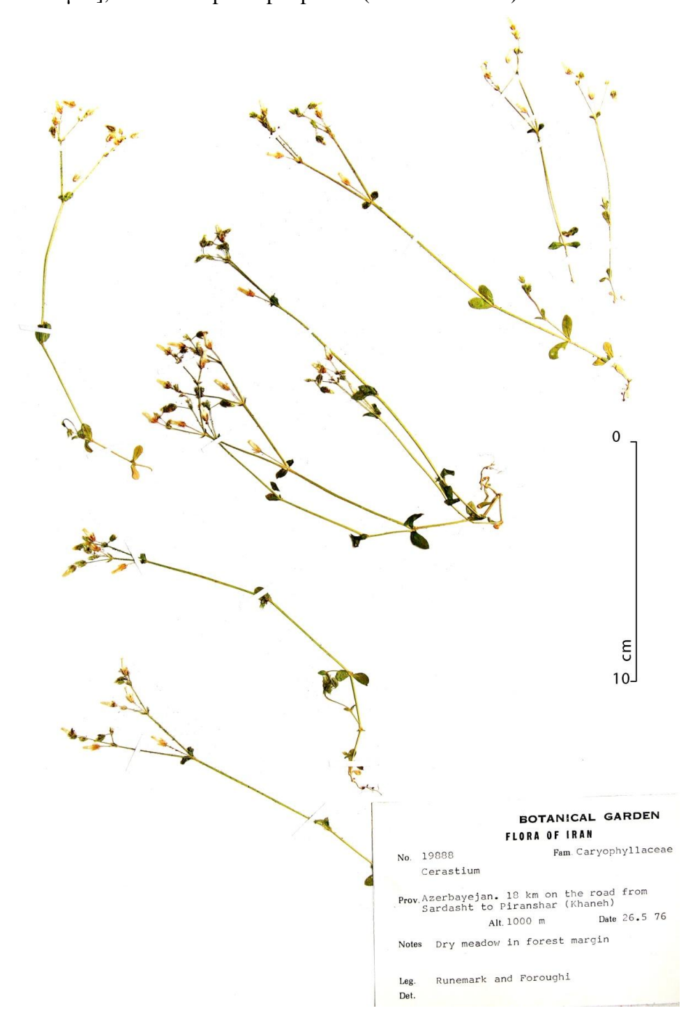
Figure 1. Cerastium pentandrum L.; Runemark & Foroughi 19888.

[12] and Perveen and Qaiser [13] (Table 2). The most important differences between pollen grains of C. pentandrum and C. balearicum were: diameter of pollen (20.280-28.049 vs. 20.140-25.157 \mu m), diameter of microperforations [0.081-0.223 (-0.361) vs. 0.0683-0.1257 \mu m], number of pores per pollen (12-14 vs. 10-12).